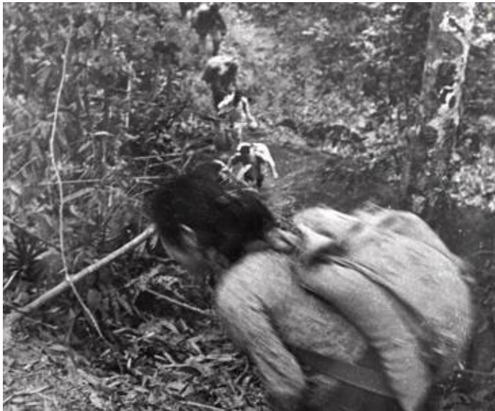
Vietnamese carrying supplies on the Ho Chi Minh Trail