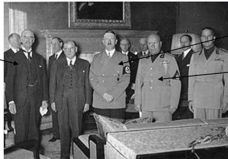
Prime Minister Chamberlain

Chamberlain gave in to Hitler's threat (appeasement).