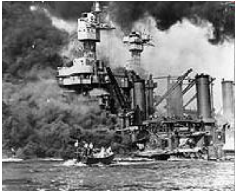
USS West Virginia

Brought U.S. into WWII on the side of the Allies.